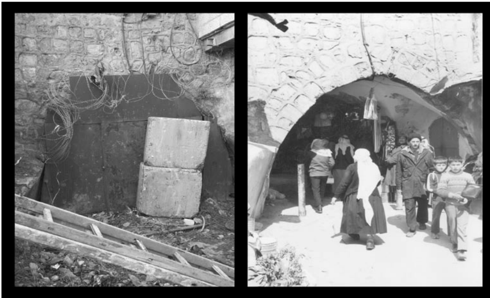
Hebron – Absentees. The comparison between the photo from the 1990's (right) and 2007 (left) expresses the true nature of the Zionist settlement movement as a destructive force which aims to erase all which stands in its path.

on Palestinian lands whose owners have been expelled. Millions of people live in a reality of imprisonment, oppression, dispossession, humiliation and denial of basic human rights. That reality is a mirror to Israeli society, an image it refuses to see. Those are the achievements of the war.