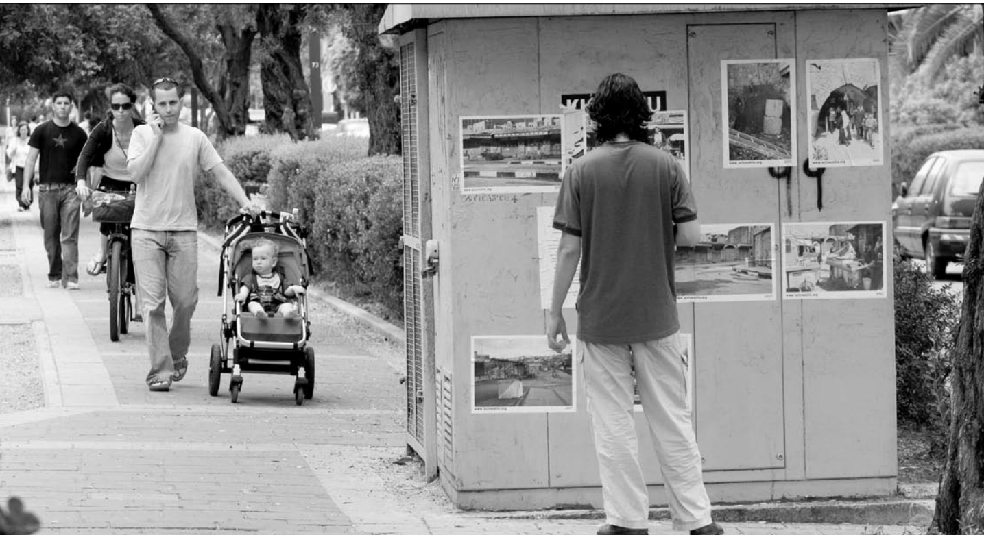
Ben Gurion Avenue, Tel Aviv, May 2007.

O n Thursday morning, 10 May 2007, the inhabitants of Haifa, Jerusalem and Tel Aviv, woke up to find some walls of their cities covered with photographs of the kind they are not used to seeing. Over night, some 1600 pictures representing 40 copies of the photo exhibition “40 to 67” had been hastily put on more than 200 walls in the streets by dozens of volunteers.