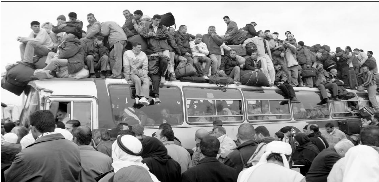
Gaza Strip - Hostages. Those who hold Gaza hostage are many. It does not start with the absence of law, and it does not end with the sealing of borders. Everything in Gaza depends on waiting and waiting, and time has no meaning.

Reactions by the Israeli public have varied, between apathy and efforts to rip off the exhibition. However, some people stopped, watched and scribbled messages and remarks.